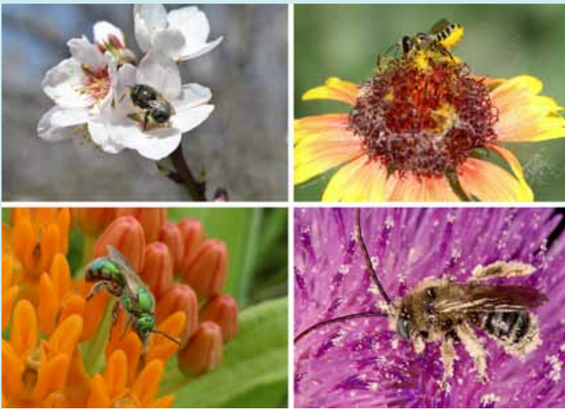
Solitary bees, clockwise, from top left: A blue orchard bee ( Osmia lignaria) pollinating an almond blossom, a leafcutter bee ( Megachile sp.) pollinating a blanket flower ( Gaillardia pulchella), a long-horned bee ( Melissodes sp.), and a pure gold-green sweat bee ( Augochlora pura) on butterfly milkweed ( Asclepias tuberosa).