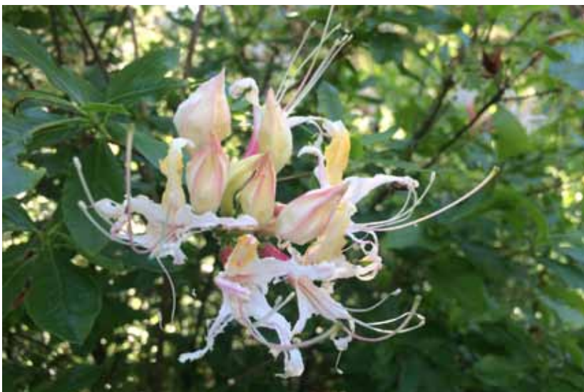
Native western azalea has more smell and is hardier here than any cultivar azalea!