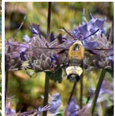
The now rare Monarch butterfly visiting a local garden and a clearwing moth

Please avoid using pesticides or treated seeds. The majority of pesticides used on gardens and lawns are "broad-spectrum" meaning they kill broadly. They kill the beneficial insects which would prey on or parasitize your crop pests.